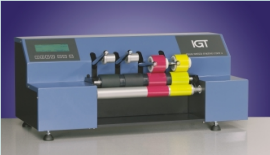
The IGT High Speed Inking Unit 4 for ultra-fast inking