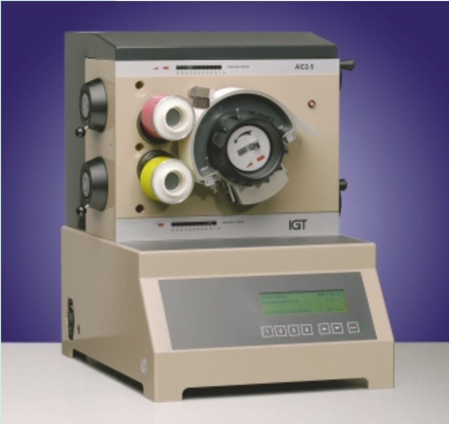
The IGT AIC2-5 suitable for many test purposes