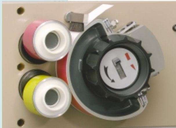
The IGT AIC2-5 suitable for two printing forms