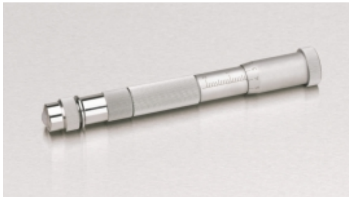
IGT Ink pipette

The use of an IGT ink pipette to apply offset ink to the inking unit is strongly recommended because it increases the accuracy of application of ink and therefore the inking, thereby enhancing the performance of the tests.