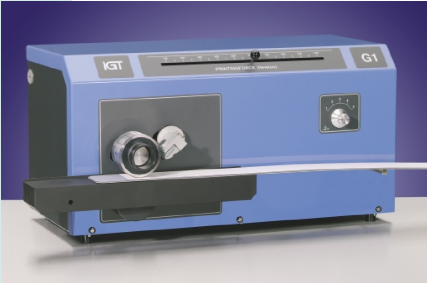
The G1-5, ready for use